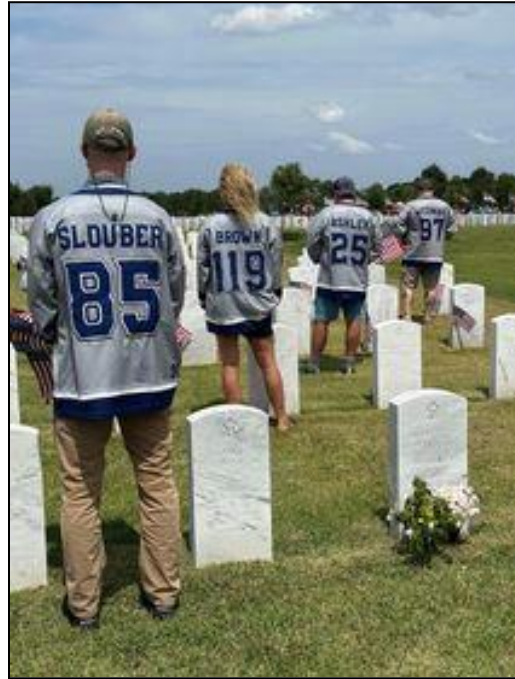
Left: Opening for the AHL Winter Classic in Charlotte, NC. Right: Wreath laying at the Jacksonville National Memorial Cemetery