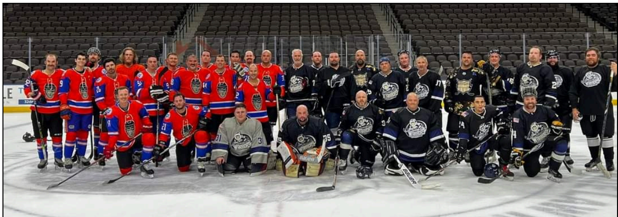
Stadium Series 2024 Veterans Showcase presented by Navy Federal Credit Union